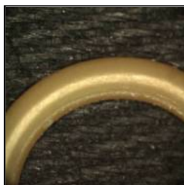
Kalrez® 9100 Top Nozzle Seal