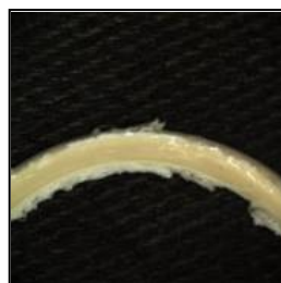
Incumbent FFKM Poppet Seal