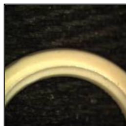
Incumbent FFKM Top Nozzle Seal