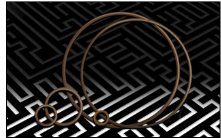
Kalrez® 9300 parts are based on a proprietary crosslinking and mechanical reinforcement system which is only available from DuPont.

Kalrez® 9300 exhibits excellent resistance to oxygen and fluorine-based plasma and etch process chemistry. It also offers very low metals content, excellent thermal stability and mechanical strength, and is well suited for both static and dynamic sealing applications. A maximum continuous service temperature of 300°C is suggested. Ultrapure post-cleaning and packaging is standard for all Kalrez® 9300 parts.